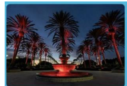
Dignity Health Sports Park