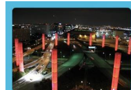
LAX Gateway Pylons