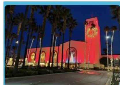
LA Union Station