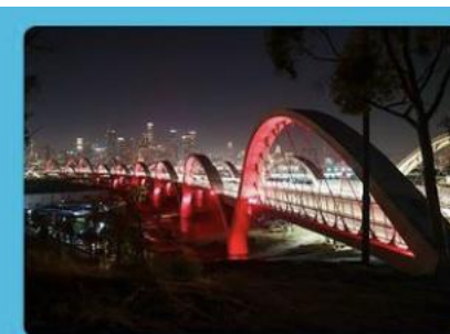
Sixth Street Viaduct