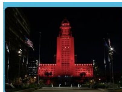
LA City Hall