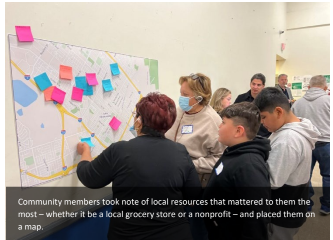
Community members took note of local resources that mattered to them the most – whether it be a local grocery store or a nonprofit – and placed them on a map.

CARES SFV and their Community Advisory Committee are taking steps to best address these impacts in their service area. One step they've taken is launching a monthly food distribution and delivery to homes of residents requesting this type of support. The food deliveries are accompanied by bilingual flyers with information on resources. CARES SFV is also partnering with other agencies such as the YMCA of Metropolitan Los Angeles and Meet Each Need with Dignity (MEND) to provide additional support and linkages to care. Together they'll continue working to ensure efforts are responding to community priorities as they evolve.